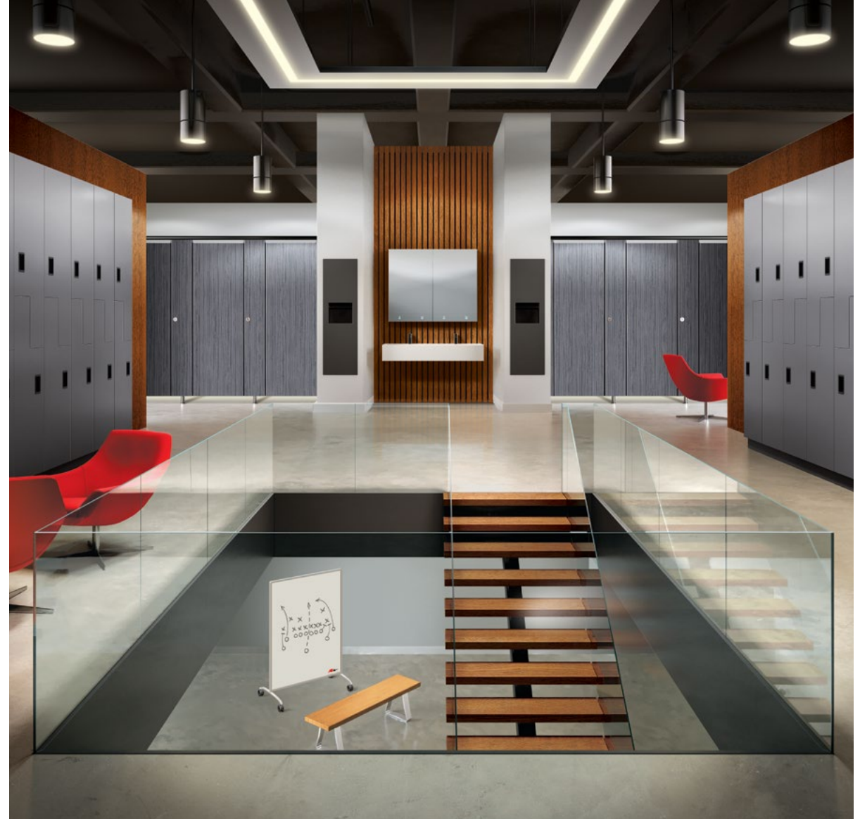
* Featured in this ad are our exclusive Velare<sup>™</sup> and Piatto<sup>™</sup> collection of washroom accessories, ASI Alpaco<sup>™</sup> partitions, and ASI lockers.

A well designed bathroom and locker room can be the deciding factor in elevating a building from good to great, and we can provide you all the options to make that possible. ASI Group has changed the paradigm—we are the new standard for basis of design.